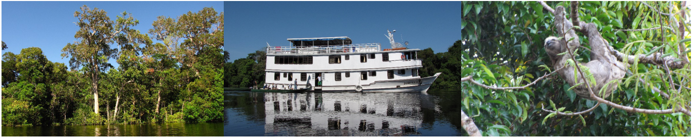
from previous Amazon trip