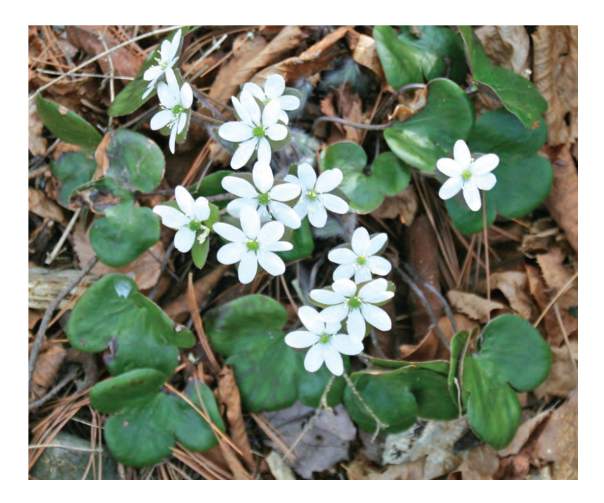
One plant with twelve flowers. Most have six petal-like sepals, but three have seven. The lobed leaves you see over-wintered from the previous year and will wilt and die away as the new leaves emerge at the end of the flowering period.

During my years visiting Hepatica habitats, I've seen flowers with five petal-like sepals and ones with thirteen. Six is the most common number, but you often find seven or eight. The size of the flowers and the shape of the sepals also vary remarkably.