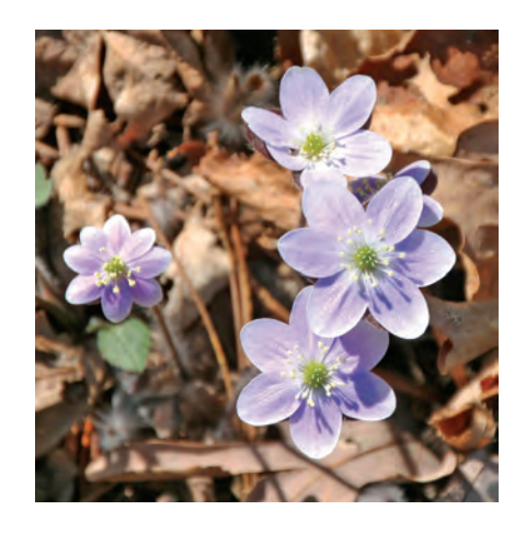
The small flower on this plant has eight sepals, while all larger ones have six sepals.

In the following photos of individual flowers from different plants, note the many features of variation. Each flower is shown at twice the natural size, so they are all to scale, and you can see the marked variation in size between different flowers. There are fine gradations of coloration within the sepals of an individual plant, and large variations between different specimens. When a flower has six sepals—the typical number—they tend to be similar to