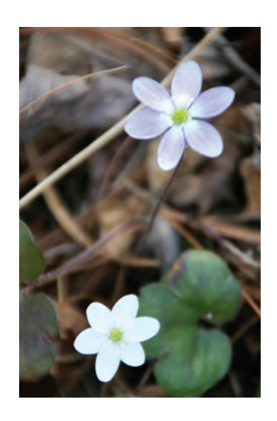
A plant with two differently colored flowers — pale violet and white.