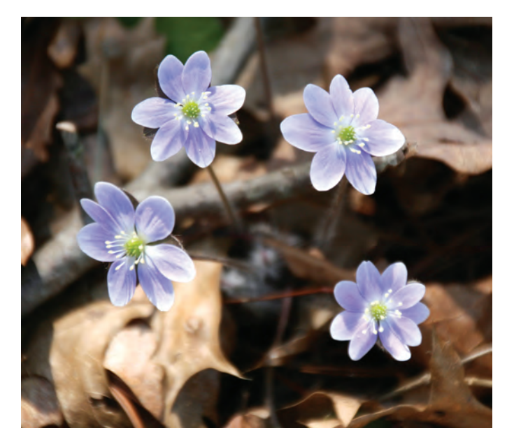
This plant has three 7-sepaled flowers and one with 9 sepals!

Catskill, New York. Each photo below showing multiple flowers is of one plant reproduced at natural size, while the photos of individual flowers on the following page present them at twice their natural size.