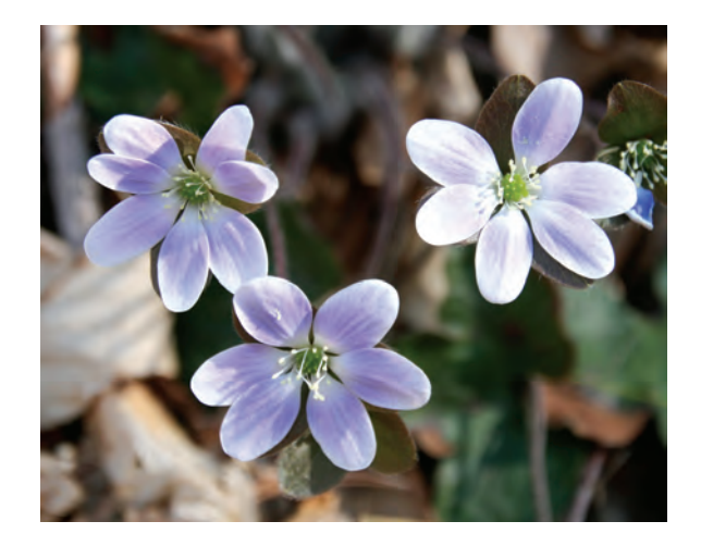
On this plant, the large flowers deviate somewhat from the radial symmetry that is typical of the species.

In the following photos of individual flowers from different plants, note the many features of variation. Each flower is shown at twice the natural size, so they are all to scale, and you can see the marked variation in size between different flowers. There are fine gradations of coloration within the sepals of an individual plant, and large variations between different specimens. When a flower has six sepals—the typical number—they tend to be similar to