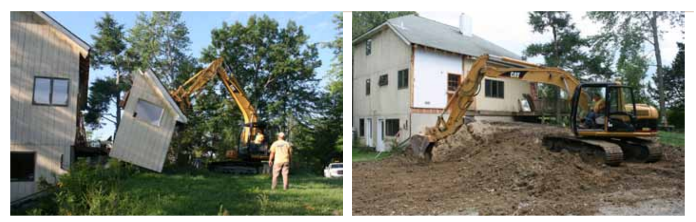
Removing the previous entryway to our building on August 13