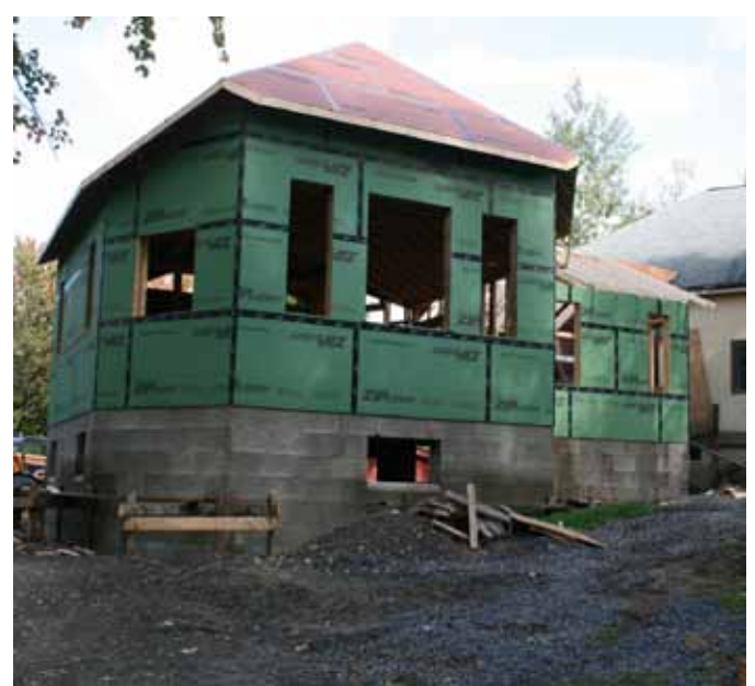
By the end of September the outer shell was nearly finished and we could experience the building in its final size and proportion. It's a beautiful structure and we aim to be using it by February.