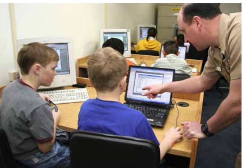
Fourth grade students learning PowerPoint

A few years ago I gave a talk at a high school graduation ceremony in a Waldorf school. In considering what I would say in this brief talk, I knew that I didn't want to say, "I hope the school has prepared you well for college or for life." Since you have just read what I wrote, you know why. In one moment it came to me: no, the goal is different. I need to say: "My hope is not that the school has prepared you for present-day culture and its existing forms and processes. Rather, my hope is that you have been educated in such a way that the world is not prepared for you. I hope you have not been hindered and that you may even have been nurtured and encouraged to develop ideas and to do things that no one expects—not in order to be different, but because